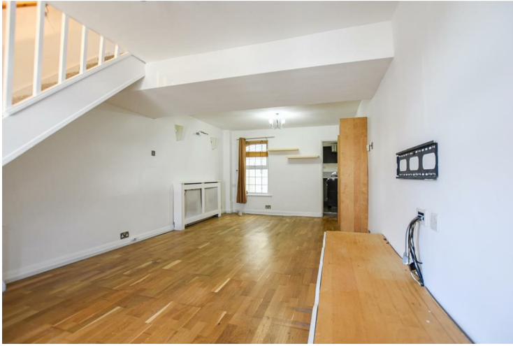
Lounge/Diner 22'5 x 11'1 (6.83m x 3.38m)