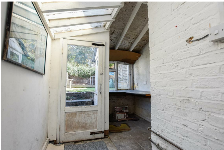
Lean to 13'11 x 4'2 plus 7'9 x 4'0 (4.24m x 1.27m plus 2.36m x 1.22m)