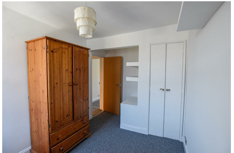
Bedroom 1 12'0 x 7 max (3.66m x 2.13m max)