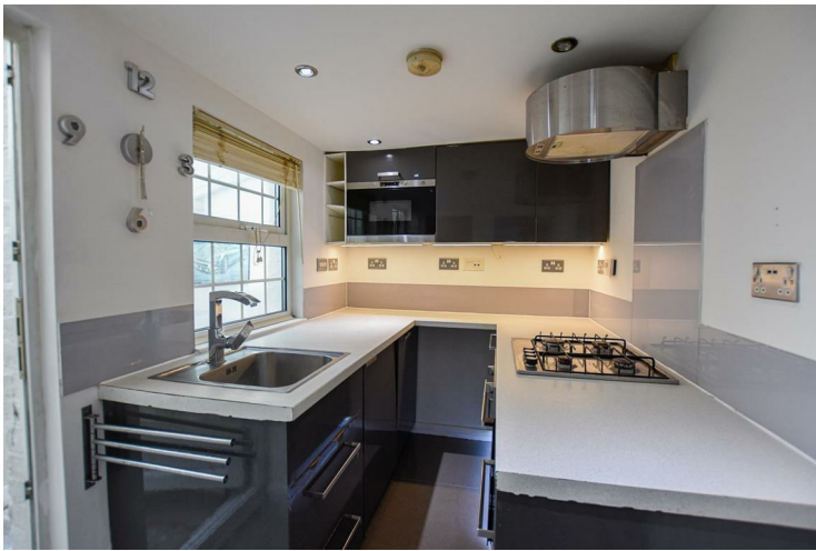
Kitchen 9'1 x 5'10 (2.77m x 1.78m)