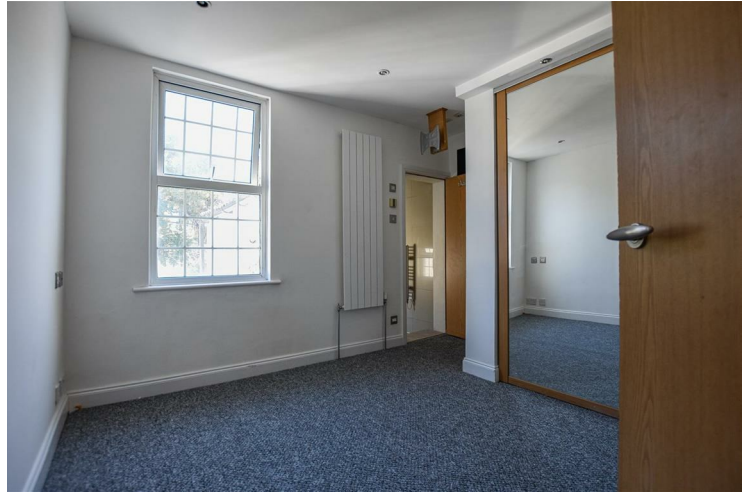
Bedroom 2 9'11 x 8'5 plus 3'2 x 2'9 (3.02m x 2.57m plus 0.97m x 0.84m )